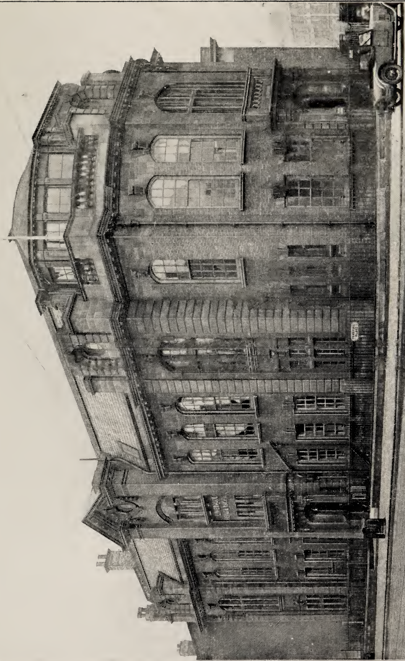
LIVERPOOL DENTAL HOSPITAL.